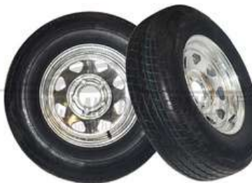
GALVANIZED TIRE AND WHEEL 14/5