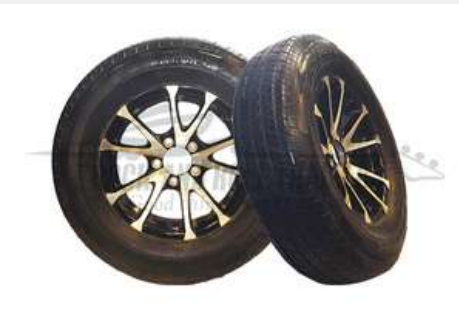
ALUMINUM TIRE AND WHEEL 15/5 205/75R/15D 5H 8PLY