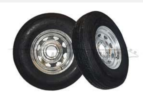
GALVANIZED TIRE AND WHEEL 16/6 235/80R/16E 6H 10PLY