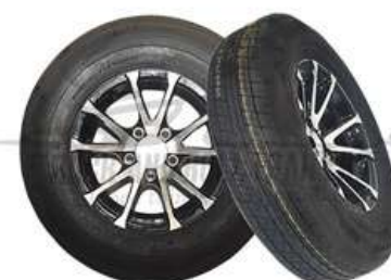
ALUMINUM TIRE AND WHEEL 14/5