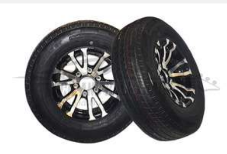
ALUMINUM TIRE AND WHEEL 15/6 225/75R/15E 6H 10PLY