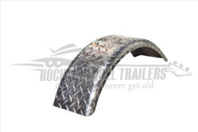
ALUMINUM ROUND SINGLE AXLE FENDER