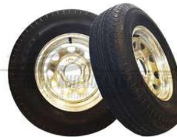
GALVANIZED TIRE AND WHEEL 13/5