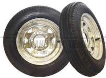
GALVANIZED TIRE AND WHEEL 12/5