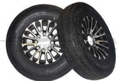
ALUMINUM TIRE AND WHEEL 16/8