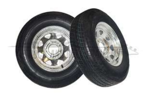
GALVANIZED TIRE AND WHEEL 15/5 205/75R/15D 5H 8PLY