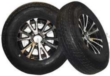
ALUMINUM TIRE AND WHEEL 16/6