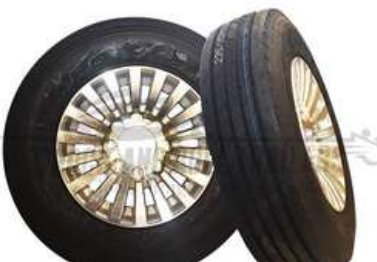
ALUMINUM TIRE AND WHEEL 17.5/8