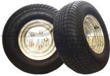
GALVANIZED TIRE AND WHEEL 10/5