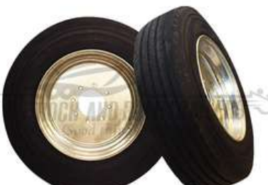
GALVANIZED TIRE AND WHEEL 17.5/8