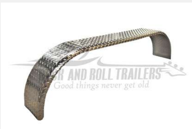
ALUMINUM ROUND TANDEM AXLE FENDER