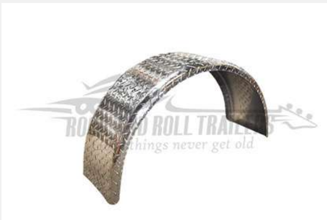
ALUMINUM ROUND SINGLE AXLE FENDER