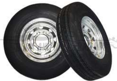
GALVANIZED TIRE AND WHEEL 16/8