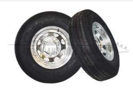
GALVANIZED TIRE AND WHEEL 15/6 225/75R/15D 6H 10PLY